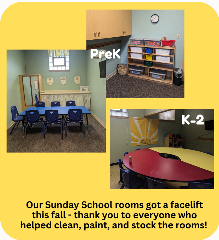
Our Sunday School rooms got a facelift this fall - thank you to everyone who helped clean, paint, and stock the rooms!